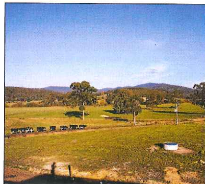
Cows move voluntarily from the paddock to be milked at Gala Farm.

lactation cows to milk more frequently than 2.4 times a day and production to increase. When the cows were in early lactation we were having regular technician visits which can disrupt voluntary cow movement so we haven’t seen the full potential yet.”